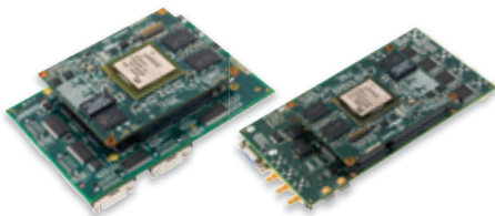
A2-CVS Acadia II Compact Vision Systems