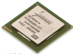
A2-SoC Acadia II System-on-a-Chip

Acadia II is available in multiple stand-alone hardware platforms that offer a variety of options for embedded systems.