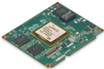
A2-SoM Acadia II System-on-a-Module