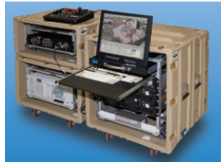
TerraSight Standard Ground Station