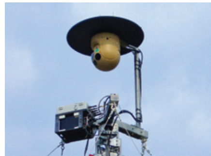
Star SAFIRE® III